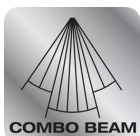
Combo Beam Combined beam of light