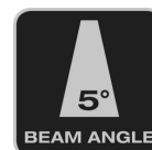
Beam angle 5° Exceptionally focused beam angle